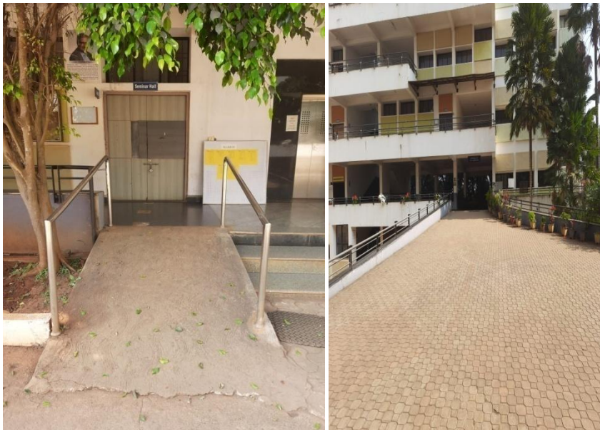
Ramps with railing