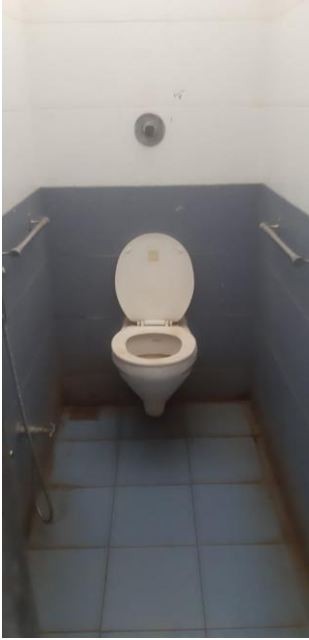
Specialized toilets for PWD

Approved by AICTE, New-Delhi, Affiliated to VTU Belagavi, Recognized by Govt. of Karnataka Accredited by NBA(Department of CVE, CSE, ECE & EEE)