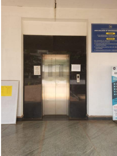
Lifts for each building