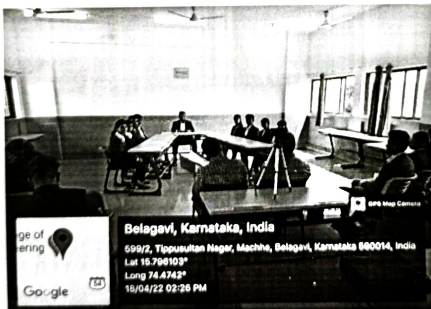
1. Students explaining their Business Plan development.