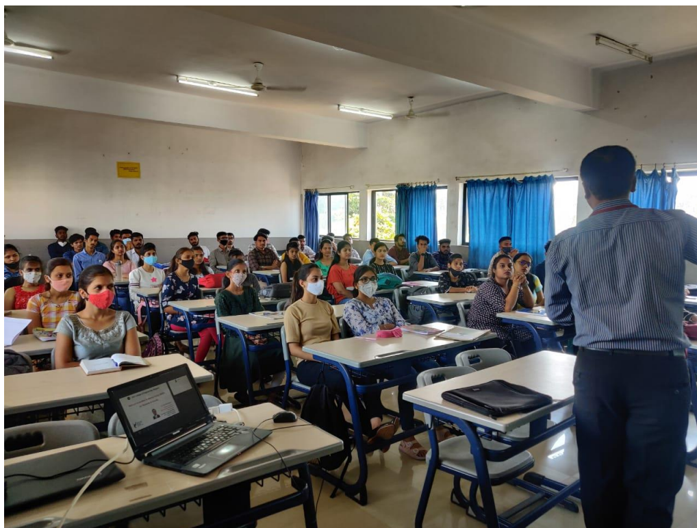
Students and faculty attending the orientation session on NISP